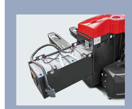
Battery side roll of